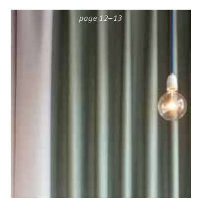
DOUBLE FACE BLACKOUT